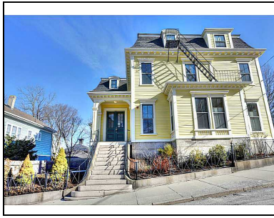
54 HALSEY ST