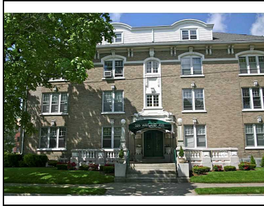
320 WAYLAND AV