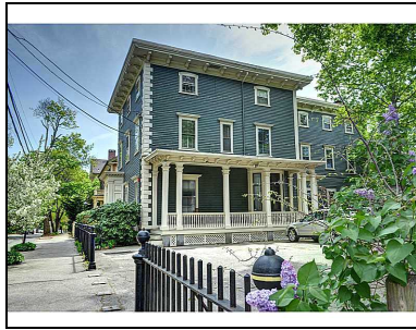
165 POWER ST