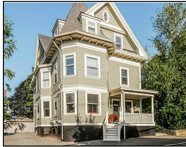
147 PROSPECT ST