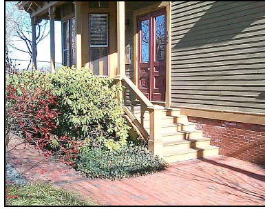
34 BARNES ST