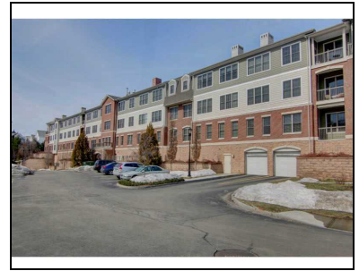
1 WAYLAND AV