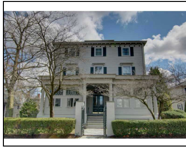
125 PROSPECT ST