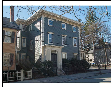
165 POWER ST