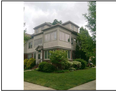
186 IRVING AV