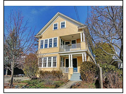
16 EMELINE ST