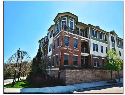
1 WAYLAND AV

List# Status City Complex Name Complex Unit #